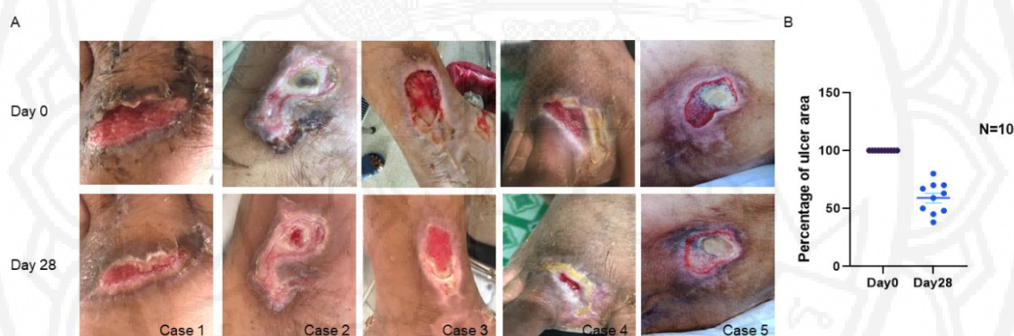
Figure 4 Effect of Dioscorea bulbifera Linn gel on wound size. (A) The wound pictures at baseline (Day 0) and week 4 (Day 28). (B) The percentage of ulcer area (N=10) compared at baseline (Day 0) and week 4 (Day 28)

After 4 weeks of using the drug, wound pictures of 5 chronic ulcer patients are shown in Figure 4A. It was observed that the wounds had narrowed and granulation tissue was pink in color with no serious adverse drug reactions, and the ulcer area was significantly reduced (N=10), as shown in figure 4B.