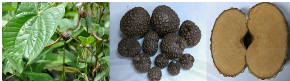
Figure 1 Characteristics of leaf and bulb of Dioscorea bulbifera Linn

Molds Count (TYMC) had to be less than 2 \times 10^1 cfu per gram or per ml and devoid of staphylococcus aureus and Pseudomonas aeruginosa .