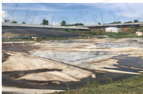
Figure 4 The anaerobic wastewater treatment of the “A” laying hens farm

The results of the analysis of the production process of this laying hen farm described as 40,000 hens, is now closed for renovations, with a total of 21 fans installed, a 1.5-horsepower fan per unit, a fan fitted with an automatic control system. This farm set at temperature 28–29 degrees Celsius, humidity 70–80%. In addition, this laying hen farms also use anaerobic wastewater treatment system to treat the wastewater arising from chicken manure. The treatment system can also produce biogas that can be used as a fuel to generate electricity in the farm. However, the problem encountered from this wastewater treatment system was that the effluent from the system was further treated in three aeration ponds, where aerators were used to improve treatment efficiency. Therefore, the stench from the farm had been released that one is a main nuisance to the villagers in the surrounding area. At the present, this laying hen farm has already covered every pond with HDPE plastic sheet as can be seen in figure 4 to prevent the overspread of stench from the farm operation.