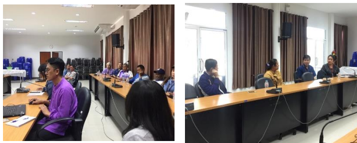
Figure 5 The focus group of this study