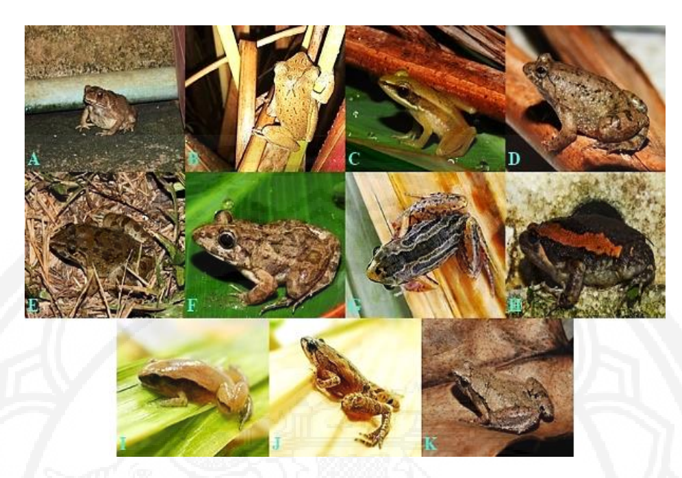
Figure 2 Adult frog species in Prince of Songkla University, Pattani Campus, Pattani Province. A. Duttaphrynus melanostictus; B. Polypedates discantus; C. Hylarana erythraea; D. Occidozyga martensii; E. Fejervarya cancrivora; F. Fejervarya limnocharis; G. Micryletta inornata; H. Kaloula pulchra; I. Microhyla heymonsi; J. Microhyla butleri; K. Microhyla mukhlesuri.