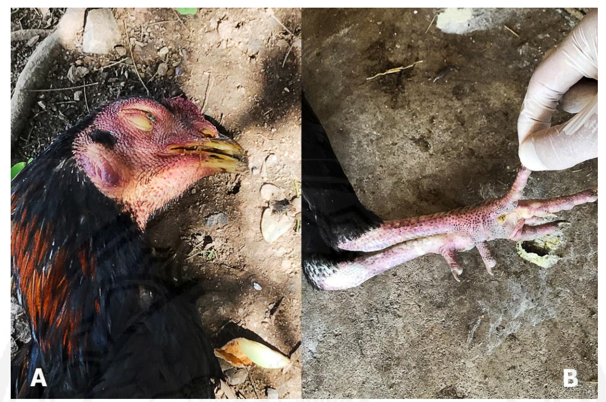
Figure 1 Lesions of disease among the poultry in Khaothong sub-district that suddenly died during August 2017; (A) cyanosis and edema of head and (B) red discoloration of the shanks and feet