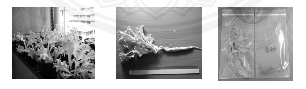
Figure 2 Harvested lettuce plant and selected parts for analysis (a. harvested lettuce, b. selected lettuce parts, c. dried lettuce tissue).