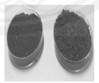
a. Sida soilb. Lignite bottom ashFigure 1 Materials prepared for the experiment (a. Sida soil, b. Lignite bottom ash)