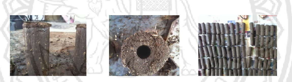
Figure 2 The finished briquette derived fuel.

Three proper ratios were chosen to produce the briquette derived fuel for subsequent experiment. Each ratio was prepared and replicated five times for the test. Observation of briquette morphology (formable and surface texture) and compressibility were conducted.