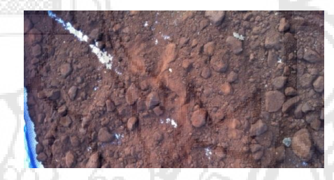
(a) Mixed scum was collected from grease trap and dried.

The mixed scum (fat oil and grease)(Figure 1) generated from Faculty of Public Health, Mahidol University canteen's grease trap was randomly collected and other mixed up wastes were separated . The coffee residue (Figure 2) was obtained from coffee shop in Faculty of Public Health, Mahidol University and other mixed up wastes were also separated as well. Both scum and coffee residue were left to air-dry in the open space for 24 hrs to reduce moisture and subsequently kept in the plastic container until use.