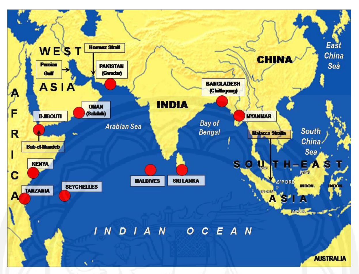
Figure 2 The Bay of Bengal and the Indian Ocean.