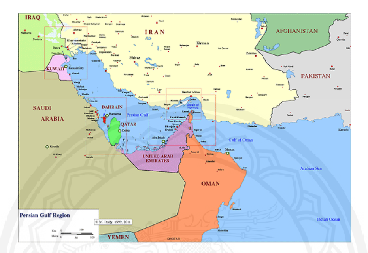
Figure 1 The Persian Gulf.

As one considers that the distance between China's Xinjiang area and Karachi or Gwadar is just about 2,500 kilometers compared to China's eastern seaboard's distance of 4,500 kilometers, the potential viability of this gateway becomes clear. Pakistan and China have been increasingly aware that the scope of their bilateral economic and commercial relations, as well as people-to-people interaction, does not correspond to their close strategic political and security ties (Mahmood, 2011).