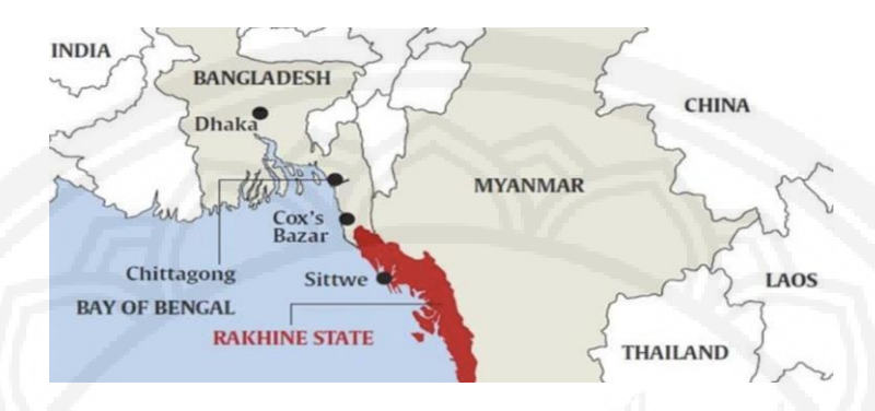
Figure 1 Bangladesh, Myanmar and China Map with the Bay of Bengal

The below map shows that South China is very close to South East Bangladesh, Cox's Bazar, where China has taken a plan to build a deep seaport in Sonadia. Even, the port of Cox's Bazar would be more nearer for China than the port which has been built in the Rakhine state. Thus, geo-strategically and geo-economically the construction of deep seaports in Cox's Bazar is so crucial for China.