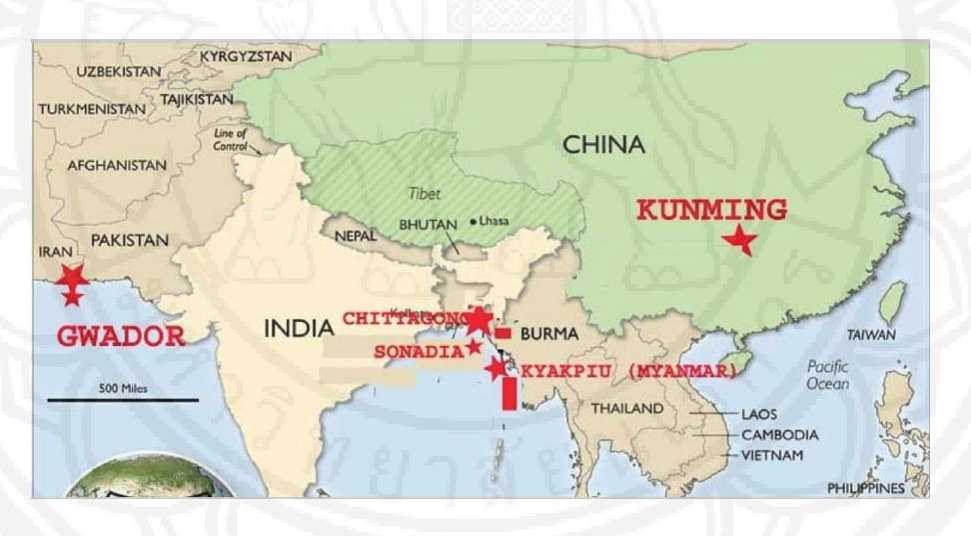
Figure 3 The Map Shows the Location of Sonadia Deep Seaport in Cox's Bazar

The below map shows that the geo-strategic location of Cox's Bazar is very attractive to China that the district is very close to South China, which, China can use for business, and oil imports purposes. North East Indian region and Tibet of China can also be connected with the Bay of Bengal through building a deep sea port in Cox's Bazar. Even Myanmar and Thailand will be able to use the projected deep seaport of Cox's Bazar in Bangladesh, for connectivity, and exports and imports purposes. Many countries of the world are highly interested in building deep seaports in Cox's Bazar such as China, USA, Japan, Malaysia, Singapore, Japan, South Korea, Indonesia, UAE and Thailand. Even India is herself interested in constructing the deep seaport in Cox's Bazar to connect its North East India with the Bay of Bengal.