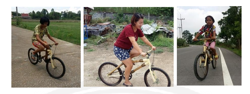
Figure 4 A demonstration of satisfaction assessment of the sampling group