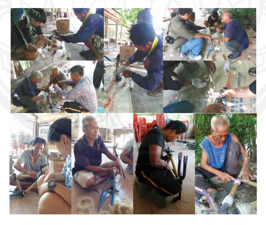
Figure 3 A demonstration of production processes of bamboo bikes by the community

To get a bamboo bicycle prototype, the researchers and the villagers in Namsong Sub-District, started from outlining its pattern derived from the creative-thinking process and thinking evaluation by applying the structure of the old bicycle with bamboo stalks grown in the community(See Figure 2).