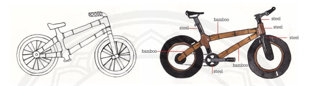
Figure 2 Simulation of model bicycle

2.5.4 Reason: The vehicle uses mechanical energy or manpower to ride for saving energy like gas and petrol. The modification of old bicycles' parts and local bamboo stalks created a value-added product.