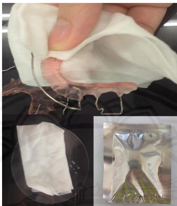
Figure 2 An example of retainer cleansing products in form of wet wipe